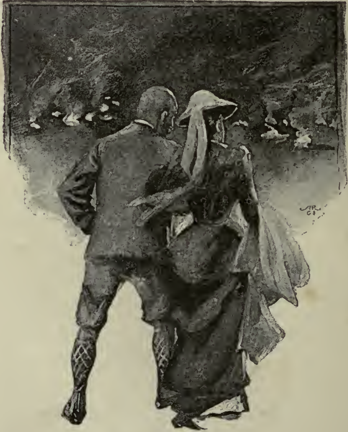
WE STEPPED OUT.

and I knew I should find the best contrast to it in the Orient, where you, fortunately, were. I may say that it is my aim to gather up